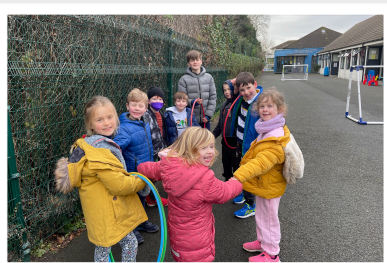
Co-operative games as part of our Mental Health Awareness Week.

Music Generation classes have resumed this term and the children are enjoying their singing, ukulele and guitar lessons. Here are 4th class practising the ukulele.