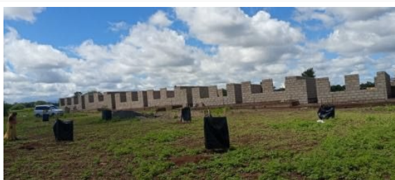
This is the school that is being built for the children in the orphanage